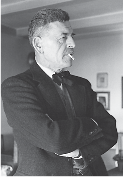
Fig. 2. Ramuz at his house ‘La Muette’ in 1941.

thing coming.’ The recurring item throughout the unpublished drafts of that novel is the theme of a deep cut between before and after: ‘There is on one hand the one I was and on the other hand the one I am now.’