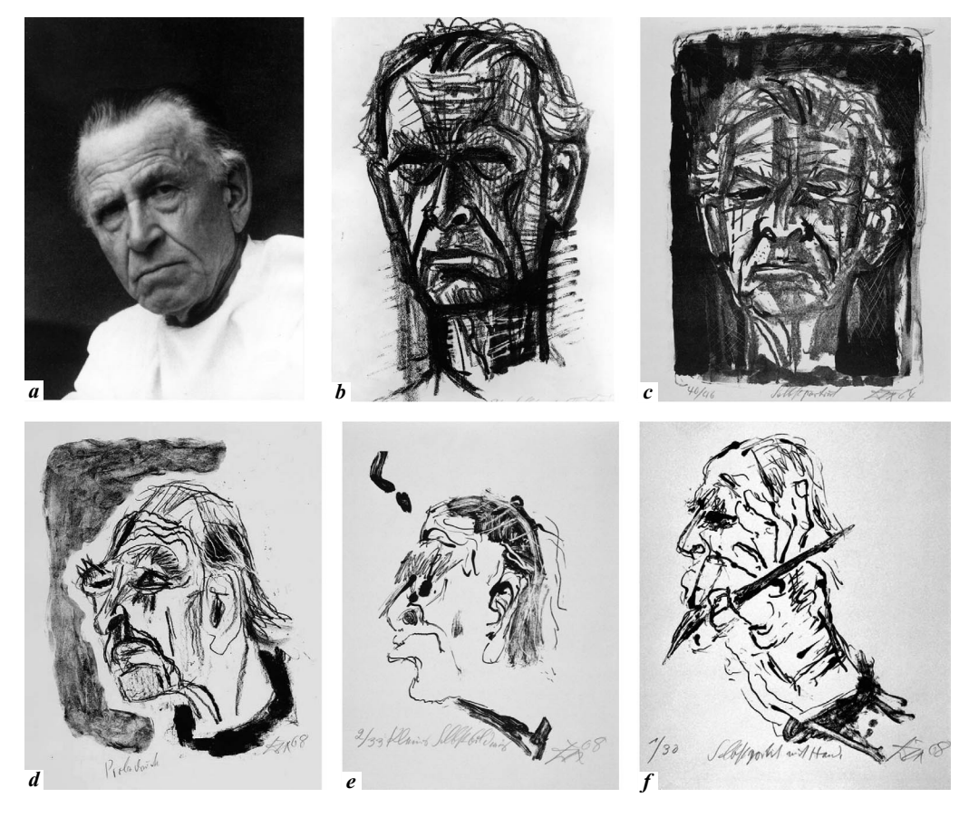
Fig. 2. 'Otto Dix' drawing style was altered noticeably in his last self-portraits. Self-portrait with black collar (1968, d), small self-portrait (1968, e), self-portrait with a hand (1968, f) and self-portrait as a skull (1968, not shown) all share the absence of a resemblance to the painter. This is substantially different from the self-portraits Dix painted in 1957 (b), 1964 (c), and 1967 whose similitude is very close to the photographs showing Dix at the respective dates (a) (copyright VG Bild-Kunst, Bonn, 2007).

pencil in the forefront of the drawing covering most parts of the lower face (fig. 2f). On this right hand we count more than five fingers – the same observation can be made with certitude in his last large self-portrait with Marcella (1969), where Dix holds the little girl with both hands. On his right hand six fingers can be differentiated. Dix continued to paint until his death, working mostly on lithographs. He died of a second stroke on July 25, 1969 in Singen. Hans Kinkel, in his preface to Florian Karsch's catalogue of Dix' graphic art describes the painter's reaction to the stroke and the series of late self-portraits as an 'obsessingly