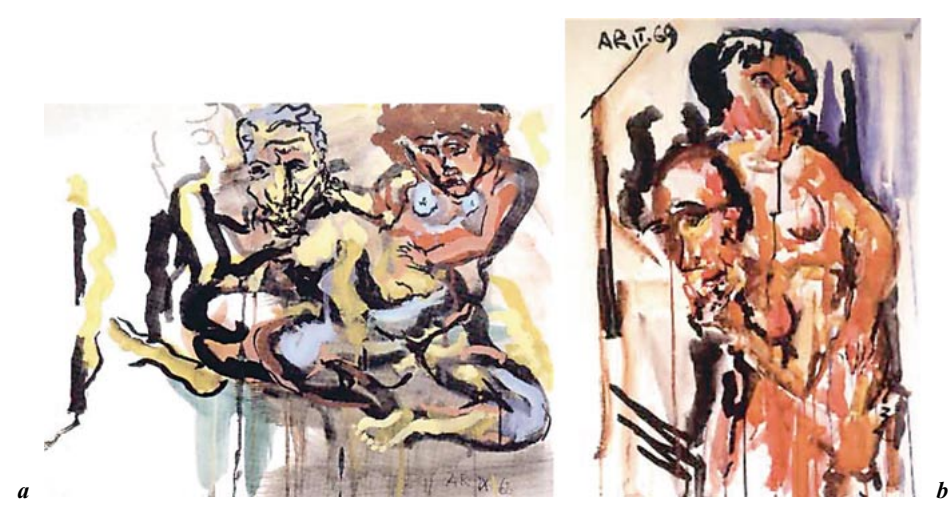
Fig. 1 a, b. Anton Räderscheidt's poststroke paintings display ecstatic scenes, often depicting couples in close personal contact. Persons are grossly deformed, the artist using brighter colors and a larger variety of colors compared to his prestroke art. A moderate left-sided hemineglect can be noted (copyright VG Bild-Kunst, Bonn, 2007).