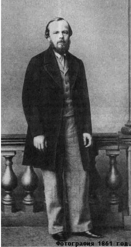
Fig. 2. A rare photograph of F. M. Dostoevsky at the age of 40.